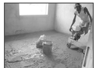
Grinding Terrazzo Floors